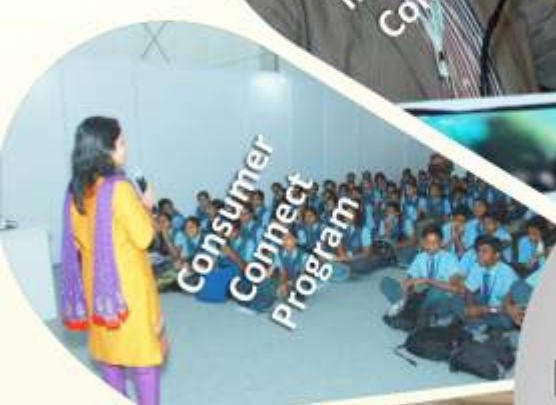
Consumer Connect Program