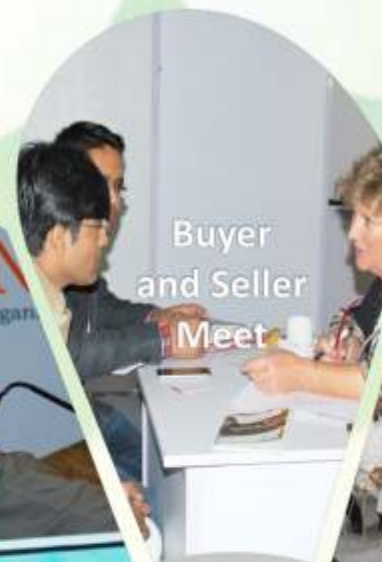
Buyer and Seller Meet