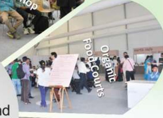
Organic Food Courts