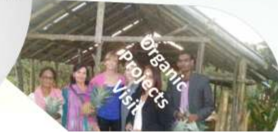
Organic Projects Visit